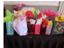
Thirty lucky ladies went home with Bingo prizes.