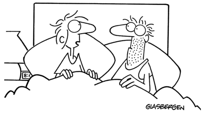
"I was going to wake up early to go jogging, but my toes voted against me 10 to 1."

Got any stories about the past regarding a NJORTC event, preferably with pictures, that you would like to tell us about? Write them up and send it to me along with the pictures and we will use it in the newsletter.