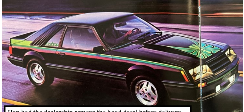
Hap had the dealership remove the hood decal before delivery.

They [the dealership] did have a nice 2.3 liter turbocharged 1980 Mustang Cobra hatchback in black with the laser graphics along the bottom sides and a buckskin interior. It was a four speed with manual brakes and steering. It didn't have air conditioning or power windows and locks, but did have a nice radio. I negotiated a price, got a loan, and now had a new