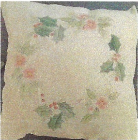
Holly on Pillow Peggy Thomas September