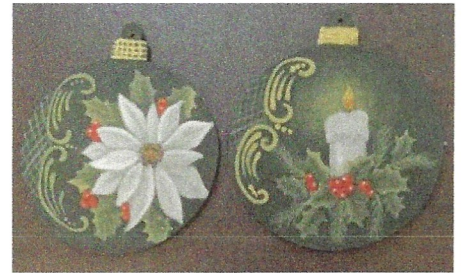
Poinsettia and Candle ornament Peggy Thomas January 2025