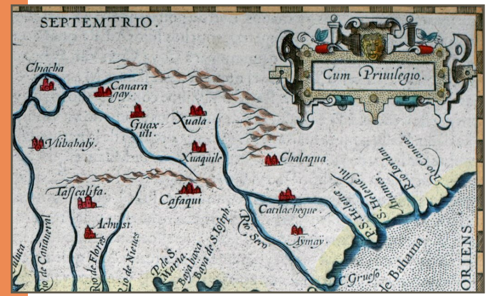
A portion of a 1584 colored map showing the location of various Native American chiefdoms in the Spanish territory of la Florida, covering most of the United States' Southeast.

When Spanish explorer Captain Juan Pardo and his men arrived in 1566, they declared the Catawba Indians, who didn't speak their language, new subjects of the king. The Spaniards forced the natives to construct the soldiers homes and provide them meals. While the two groups lived side-byside, the relationship was fraught by mounting mistrust and resentment. The tension ultimately propelled the Catawba to force the Spanish army out—changing the course of American history. The absence of the Spaniards allowed for English colonists to move inland and take their place. It's how the English language gained a foothold in the region.