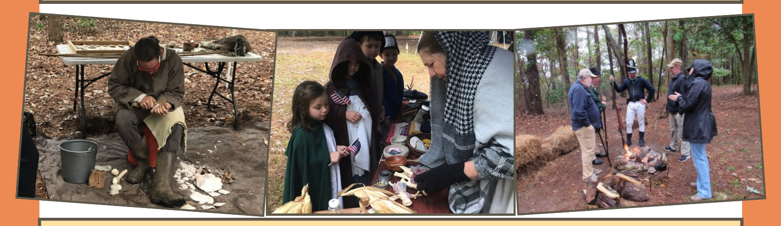
Reenactors help to tell the story of Fort Daniel and Gwinnett County