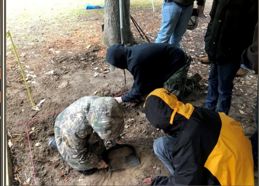
Public Archaeology at Fort Daniel