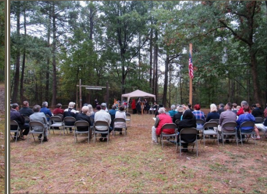
(pictured from left to right) View of the Historic Marker through the Original Gate; Past meeting the Present; and over 80 People attending the Dedication