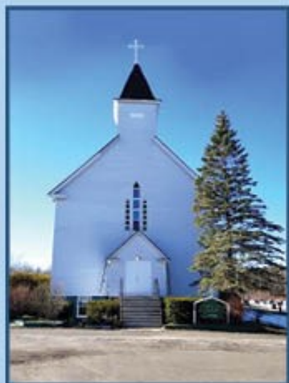
Saint Lawrence O'Toole Irishtown