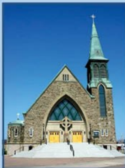
Saint Augustine's Moncton