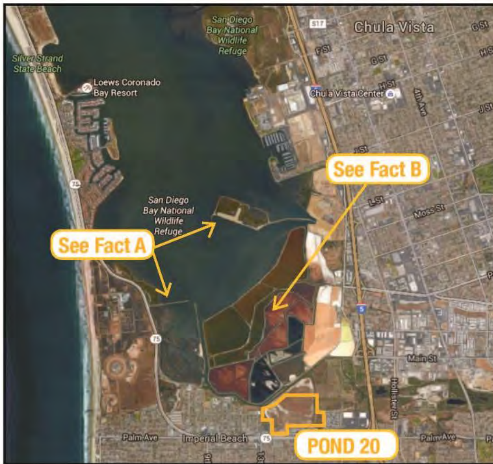
Figure 1 - The 95 acre Pond 20 is perfectly situated to benefit the communities of the IB Area, and is the rarest opportunity for prosperity we have ever been given. Pond 20 is now being taken away by special interest groups seeking to use Pond 20 for “mitigation”, instead of the “economic development” promised by the Port District. The Port District has neglected public input and ignored specific needs of the IB Area.

Fact 1- Since the 1998 giveaway of Western Salt land to “mitigate” projects to the North, only portions along the “scenic route” to Coronado and Chula Vista Marina have had attempted restoration.