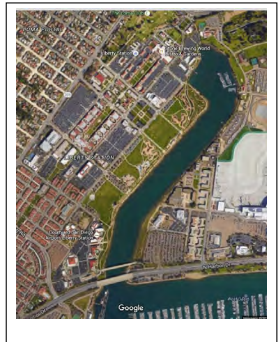
Figure 2 – Liberty Station was made possible by a generous gift from the IB Area around 1998 when a majority of the Western Salt property was used to “mitigate” for the multi $billion economic and public amenities for the people of the Point Loma Area. When you visit Liberty Station you will see a mile long bay front access with parks, public amenities, multitudes of groups and families picnicking, children playing, sporting activities, people fishing from the shore line, businesses thriving, swimmers and sailboats, paddle boarders, outdoor events, etc, etc, ..... and yes,..... a beautiful “view corridor”.