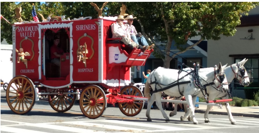
The San Joaquin Shriners' Calliope pulled by white draft mules, complete with live pipe organist!