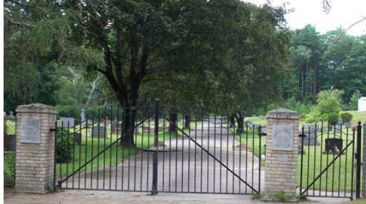
Main entrance to St. Casimir's Cemetery

An ongoing project at St. Casimir's parish is to rebuild the back road entrance to the cemetery grounds and make it similar in appearance to the cemetery's main entrance.