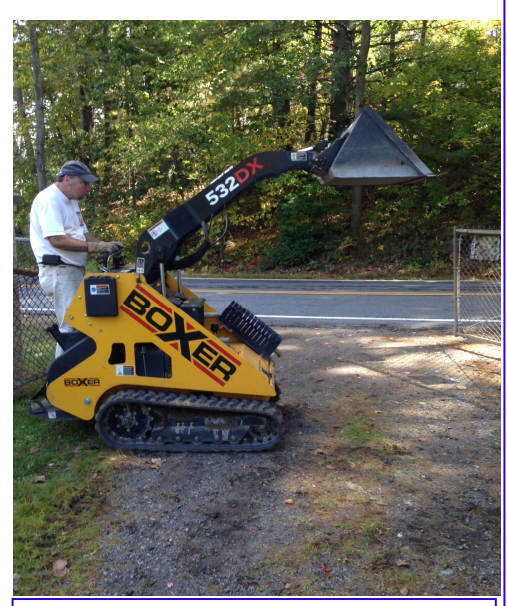
Making good use of the skid steer machine, a one day rental, to perform routine perpetual care activity including repair of the grassy areas damaged by grub activity.