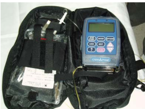
IV Bag is hooked to Infusion pump and able to be carried in a carrying case with a strap.