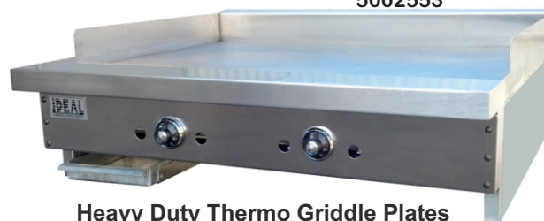
Heavy Duty Thermo Griddle Plates