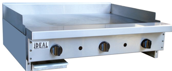
Heavy Duty Manual Griddle Plates