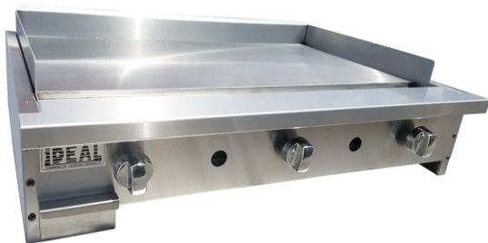
Snack Line Griddle Plates

Ideal Cooking Products Counter top Line-up align perfectly with other Ideal Products on height, depth and other design alike features such as bull noses, chassis depth and height among others.