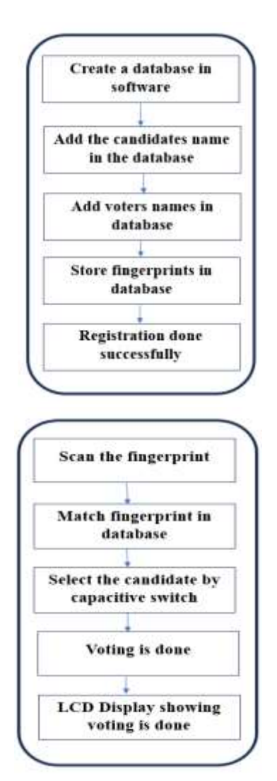
Fig:2. Procedure for registration and Voting.