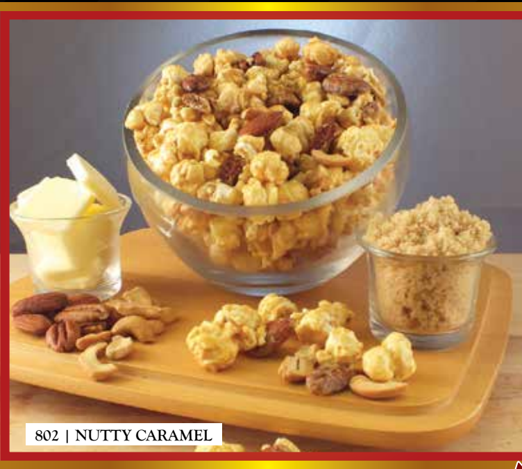
802 | NUTTY Caramel