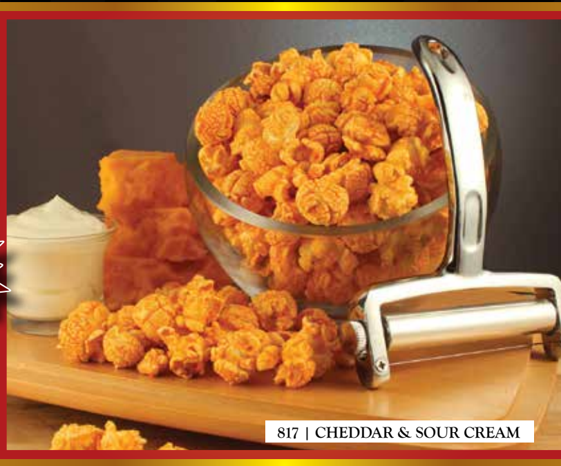
817 | CHEDDAR & SOUR CREAM