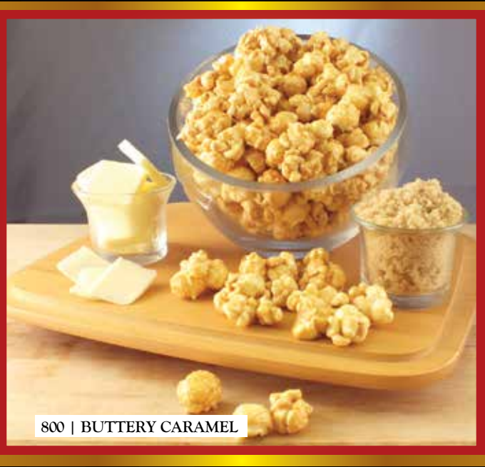
800 | BUTTERY CARAMEL