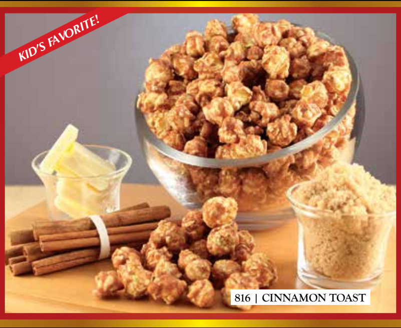
816 | CINNAMON TOAST

1 Gallon Resealable Bag. A rich and buttery classic that is a favorite for many! Our family recipe uses sweet brown sugar, creamy butter and a cooking temperature perfected to deliver the right caramelization of every kernel. Absolutely Amazing! Gluten Free. $14.00