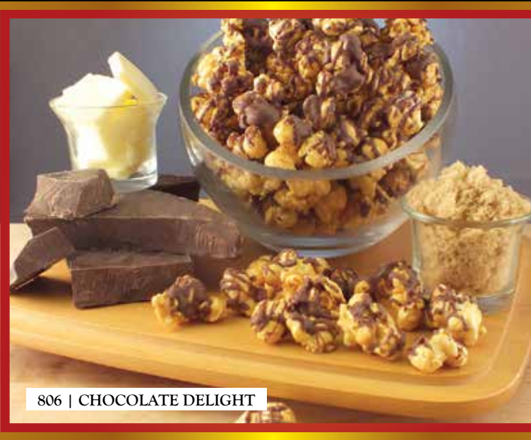
806 | CHOCOLATE DELIGHT