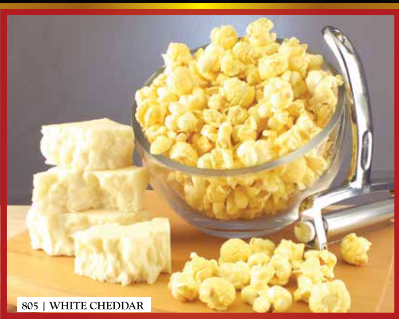
805 | WHITE CHEDDAR

1 Gallon Resealable Bag. Our special blend of creamy white cheddar coats every inch of our fluffy white popcorn, so no bite lacks in cheesiness. Leaving your mouth in a state of complete and utter elation. Gluten Free. $14.00