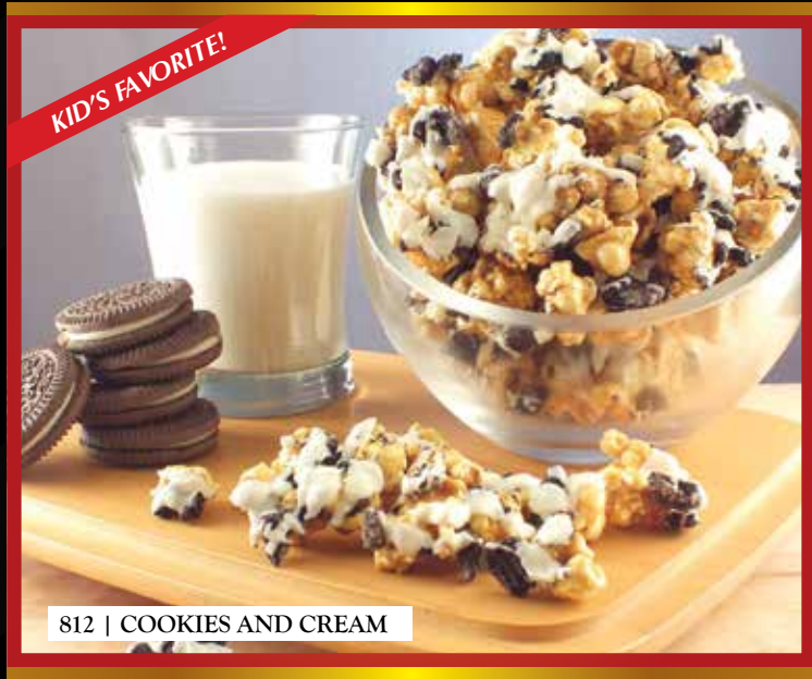
812 | COOKIES AND CREAM

Half Gallon Resealable Bag. We've taken our Signature Cookies & Cream Popcorn to a whole new level. The taste of chocolate cookies get even better when they're gently tossed with freshly glazed white chocolate and popcorn. Cookies get a bit o' glaze, popcorn gets nubbins of chocolate, and you get superior taste in every nibble. Contains Gluten. $14.00