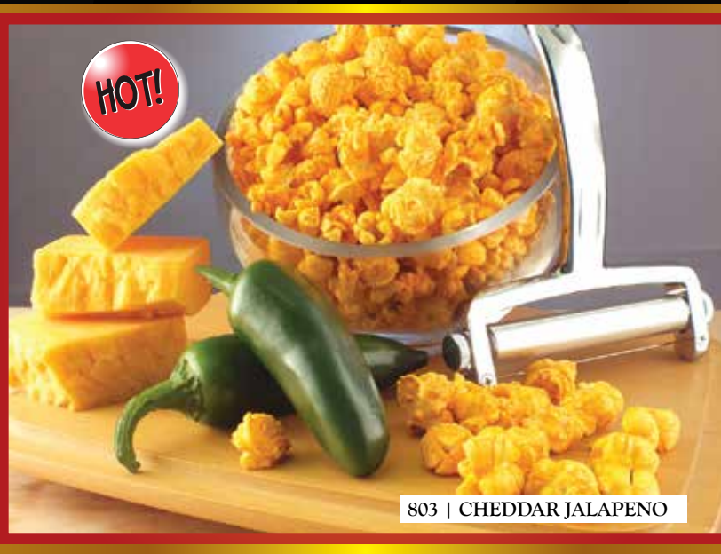
803 | CHEDDAR JALAPENO