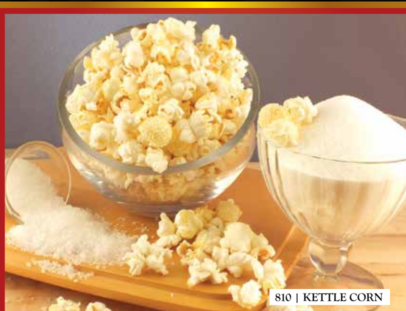
810 | KETTLE CORN