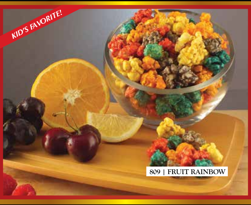
809 | FRUIT RAINBOW