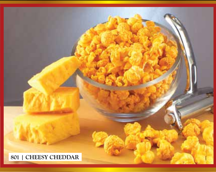
801 | CHEESY CHEDDAR