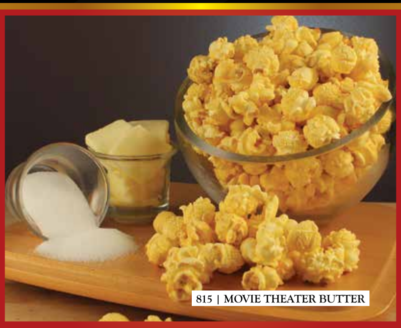
815 | MOVIE THEATER BUTTER

1 Gallon Resealable Bag. A favorite with kids! Our Fruit Rainbow popcorn brings the colors of the rainbow and the flavors of grape, lemon, orange, blue raspberry and cherry in a light, crunchy coating. Gluten Free. $14.00