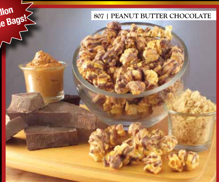
807 | PEANUT BUTTER CHOCOLATE