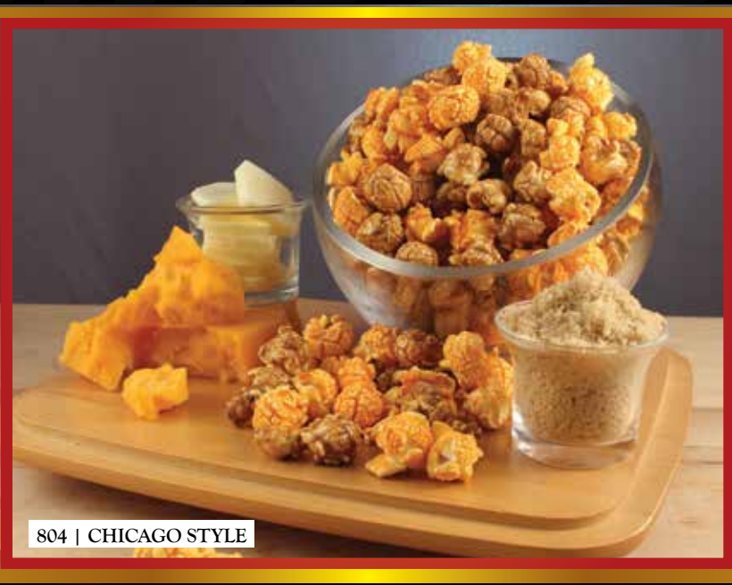
804 | CHICAGO STYLE