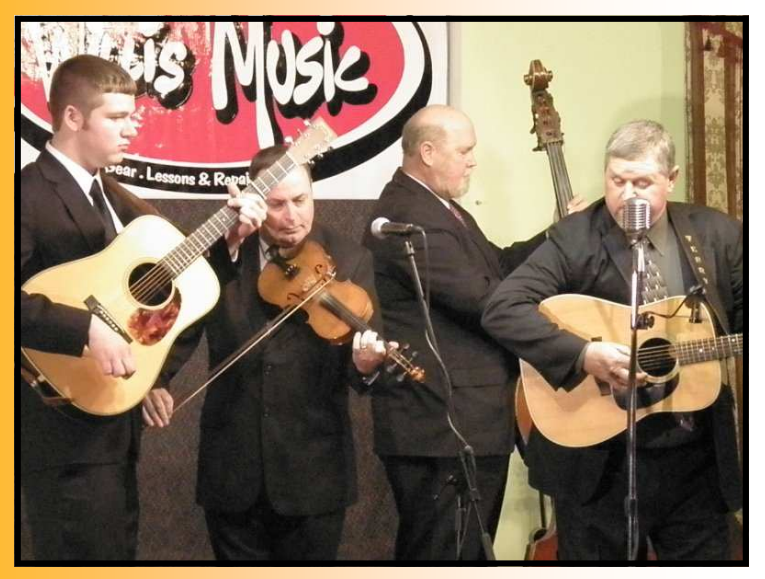
Bluegrass 101 performing at Willis Music for the WoodSongs Coffee House Event on January 21, 2012