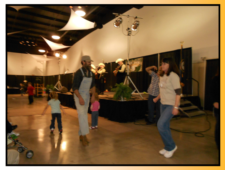
Longlegs kickin' it up at the Tommy Brown Saltlick festival this past February