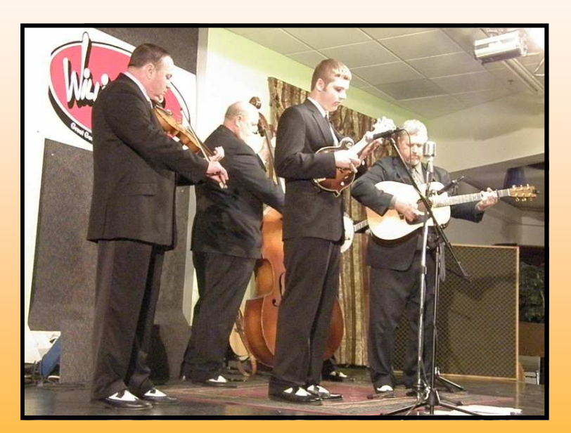
Bluegrass 101 performing at Willis Music During their WoodSongs Coffee House event on January 21st 2012

The sidewalk was just treacherous! While there were no real ice issues, just the distance from the front door to the car was almost more than I could handle. Once I finally made it to the car, I thought the best line of defense against old man winter was a trip to the store to stock up on milk and bread. While we already had three gallons of milk and four loaves of bread, I couldn't overcome the feeling that I may get snowbound for at least a few days and completely run out of the two most important food groups known to man. It is a known fact that people eat more bread and milk during bad weather to bulk up. Basically we're all squirrels at heart.