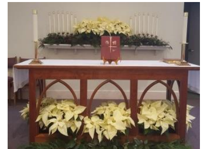
The church decorations were beautiful! Thanks to all who donated greens, poinsettias, time, talent, and energy!