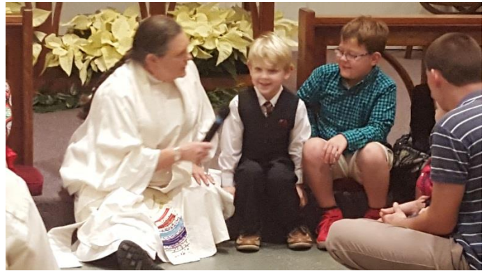
The Children's Sermon on Christmas Eve.