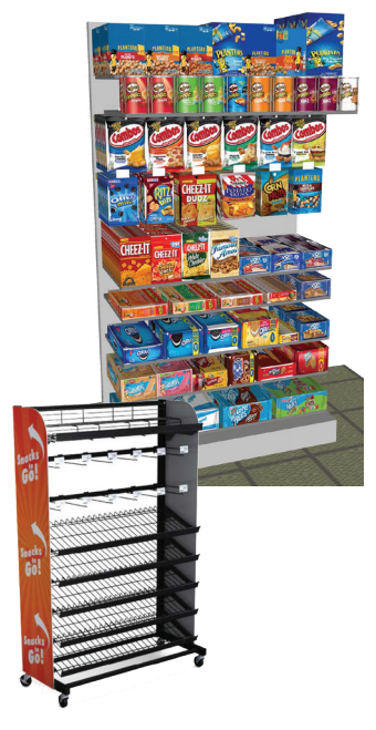
WAM 3FT Candy Yum MVD