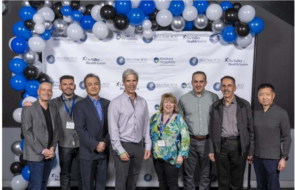
The team from Nevada Cardiology Associates

If you'd like to be entered to win a prize at the next practice meeting, respond to the email to which this newsletter was attached with the words "MARCH AHEAD" in the subject line.