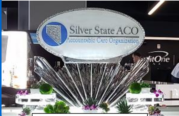
SSACO Ice sculpture

It was an evening of celebration and networking and was, itself, a