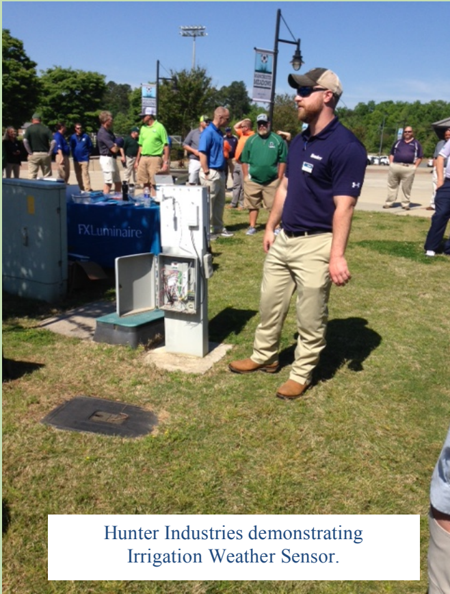
Hunter Industries demonstrating Irrigation Weather Sensor.