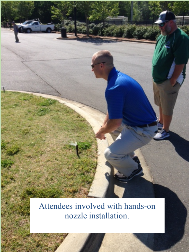
Attendees involved with hands-on nozzle installation.