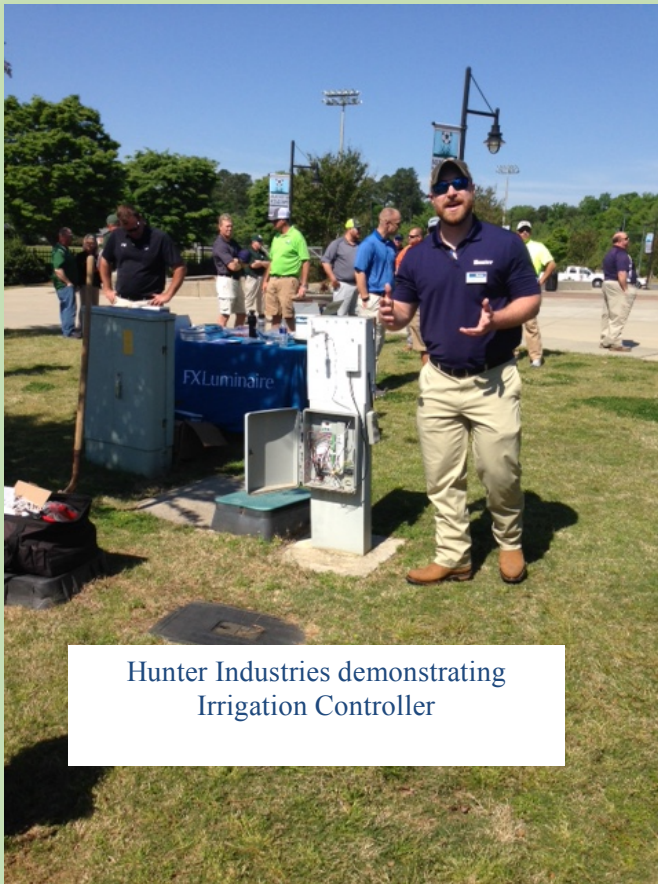
Hunter Industries demonstrating Irrigation Controller