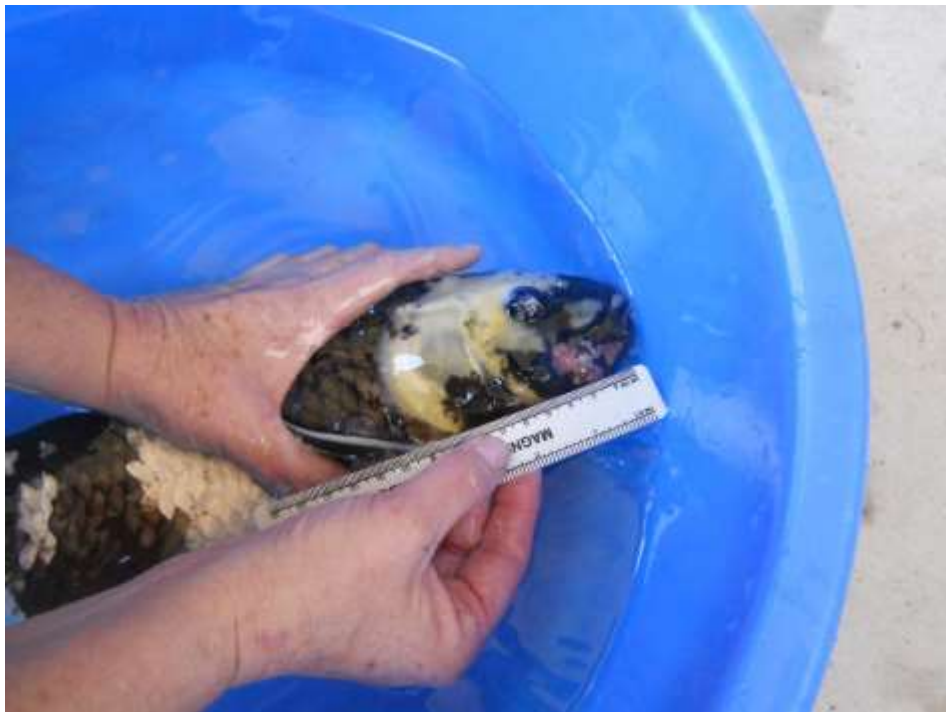
Figure 4. Phase II Tumor location approx. 1.5 inches in length (mouth to gill)