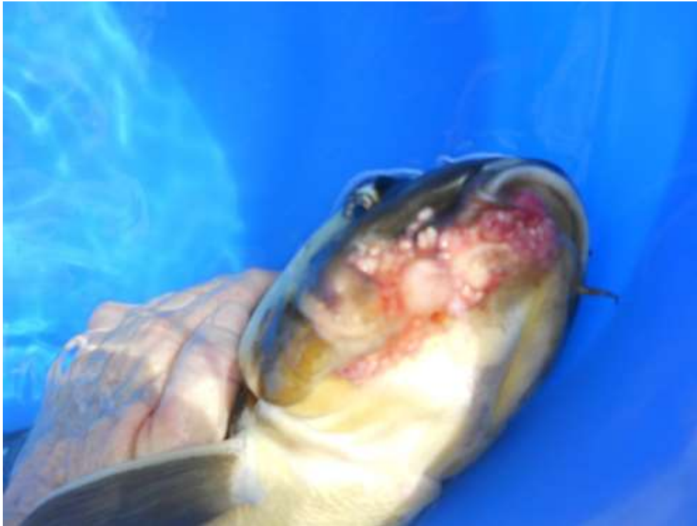
Figure 6. Tumor Growth on Sept 10th

Several new tumors have emerged along the jawbone and mouth area. After these photographs were taken, the koi was injected with another round of hydrogen peroxide.