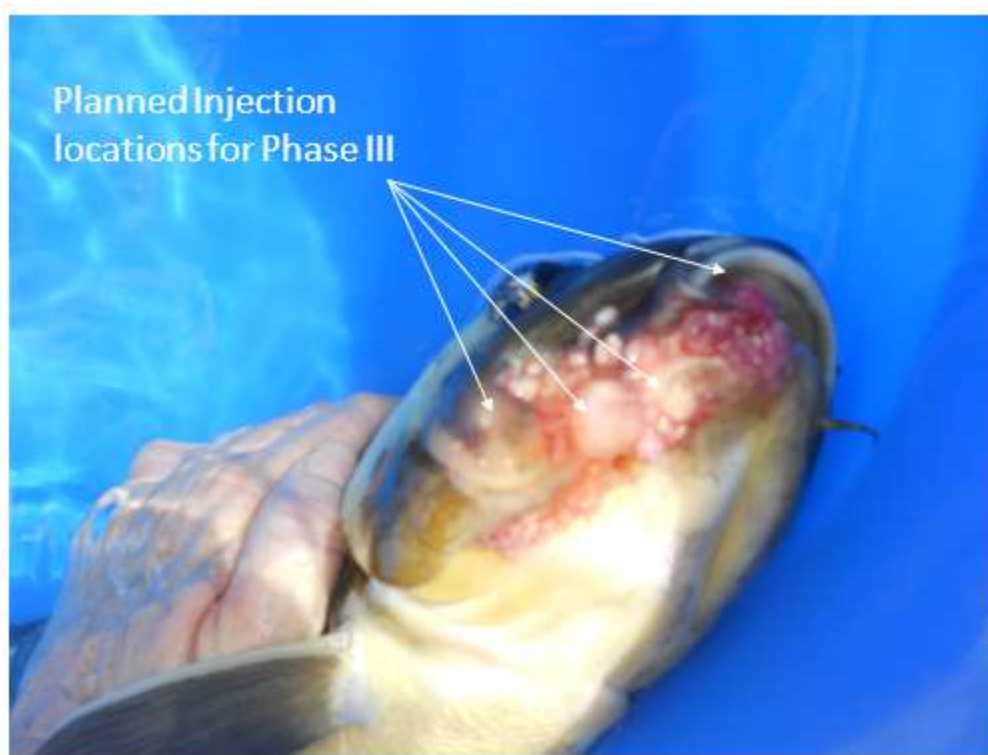
Figure 8. Phase III Planned Initial Injection Locations

In Phase II, the 3% hydrogen peroxide infrequent injections (weekly or twice a week) have not eliminated the tumor(s). Results are somewhat disappointing. Regrowth has occurred, but injections have prolonged the koi's life and the fish continues to swim and eat small/medium pellet food. There is no visible evidence of the tumor spreading to other areas of the koi. The Phase III trial, which will begin Sept 16 th , higher strength hydrogen peroxide will be used. The koi will be injected with 35% hydrogen peroxide into the hard tumor areas and larger soft tumor areas. Less hydrogen peroxide will be injected since the strength (oxygen content) is significantly higher. The injection locations (see Figure 8) will be lower jaw, fleshy cheek and mouth area. The koi will be reexamined on Oct 1 st .