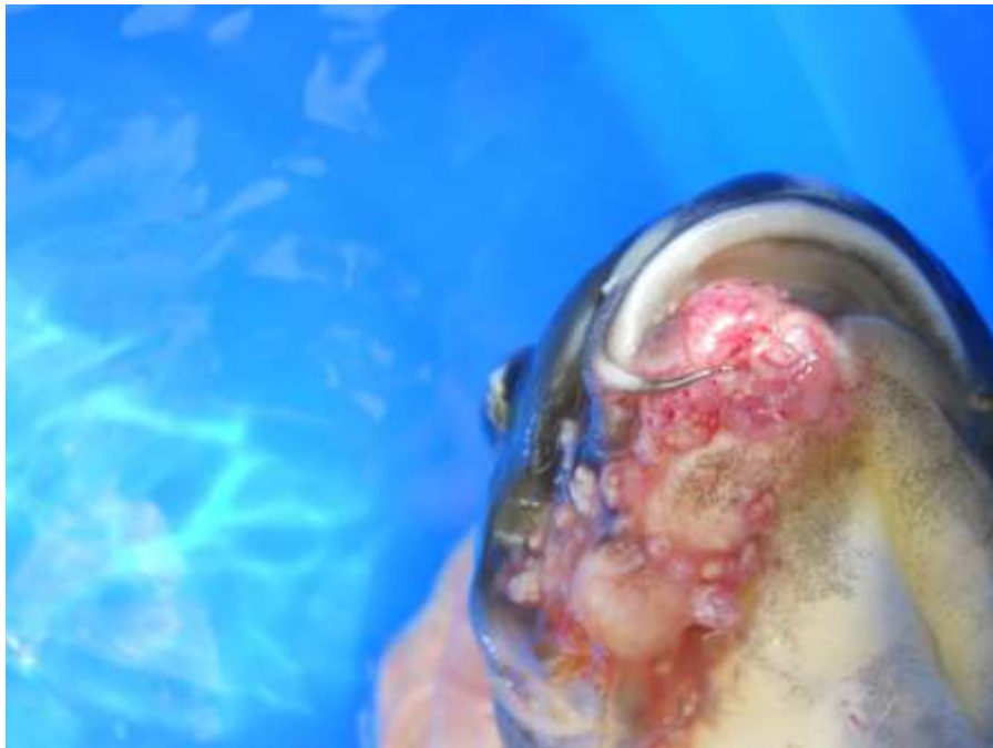
Figure 7. End of Phase II – Tumor growth in areas outside the immediate injection site