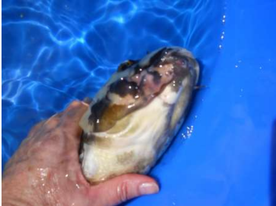
Figure 2. End of Phase I – Much improved contour

In Figure 2, there is evidence on the right underside part of the right jaw, of pink fleshly-like areas where the tumor was still visible but showed significant shrinkage. No further injections were performed from June 25 th through July 8 th . On July 8 th , the koi was re-examined and it was obvious that without the injections, the tumor had indeed grown in size and there were many localized areas of small tumors (tapioca-like growths), see Figure 3 and Figure 4. The Phase II trial study was initiated on July 8 th with additional injections of 3% hydrogen peroxide using the same protocol that was used in phase I.