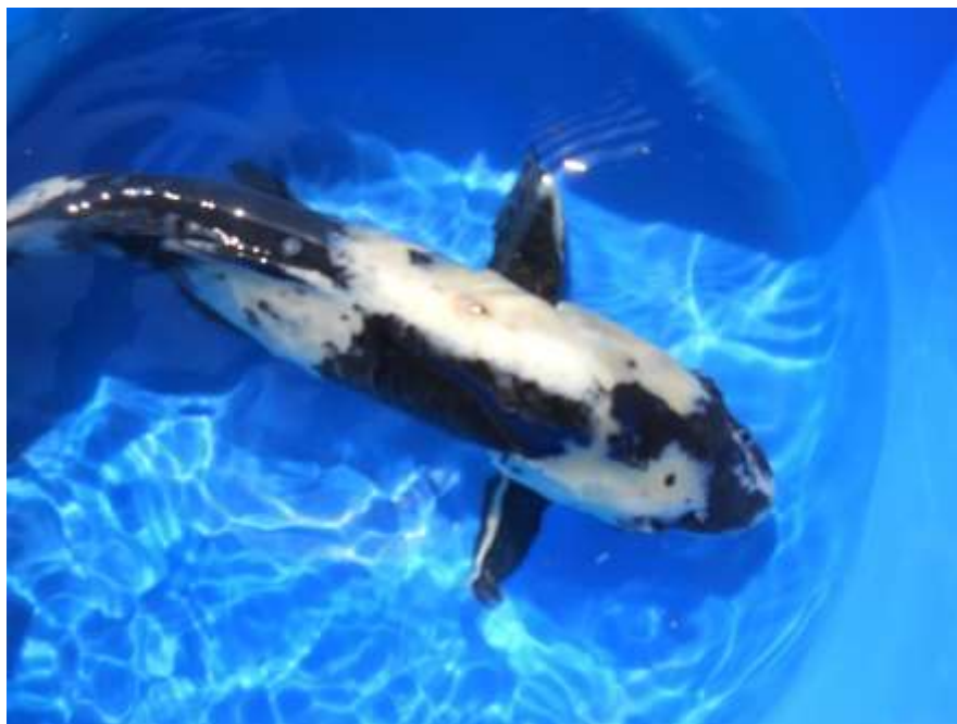
Figure 1. End of Phase I - Koi

In Phase I of this case study, injections of 3% hydrogen peroxide directly into an aggressive tumor in a Shiro Utsuri koi were able to reduce the tumor but not eradicate it. On June 25 th (see Figure 1 and Figure 2 at end of Phase I) the koi tumor had shrunk and exhibited a much improved facial contour.