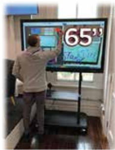
65" G-View GV65T Interactive Flat Panel