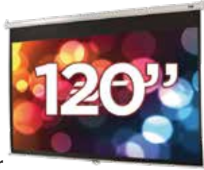
Elite Screens 120" 16:9 Manual Pull Down Projector Screen