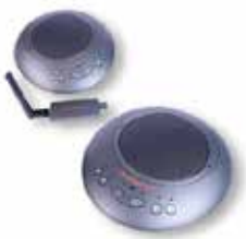
HuddlePod Air 2 Duo Speakerphone