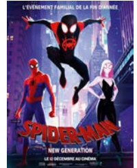
SPIDER-MAN INTO THE SPIDER-VERSE 12/22