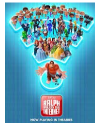
RALPH BREAKS THE INTERNET 12/8

Don't miss the next Sensory Friendly Film!