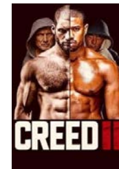
CREED II 12/11