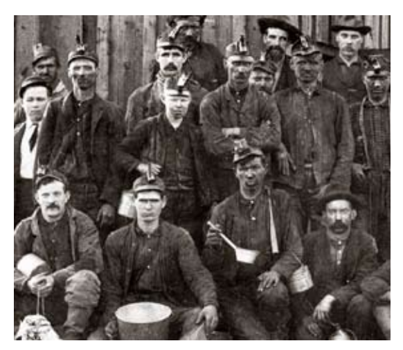
Arts & Culture Strategic Plan | Page 17