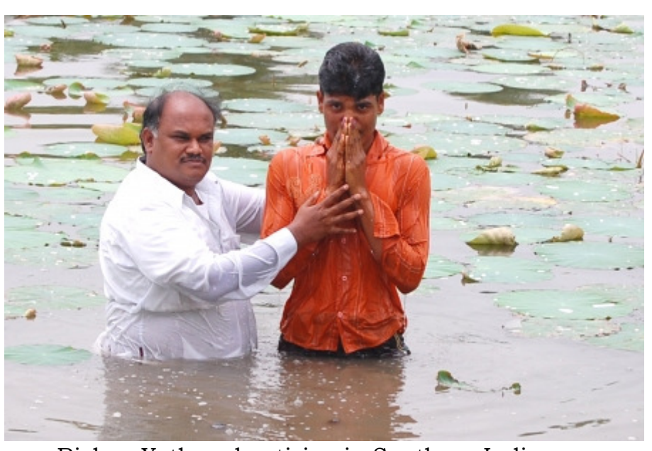
Bishop Yatham baptizing in Southern India