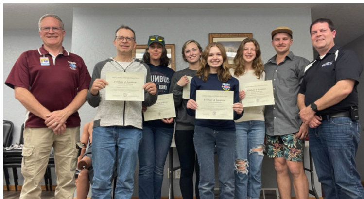
2023-2024 EMT GRADUATES