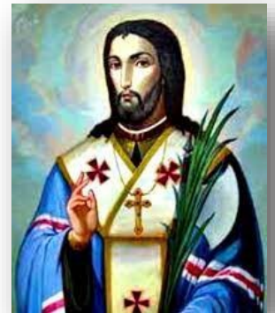
Feast Day: November 12

Despite warnings, he went to Vitebsk, still a hotbed of trouble. Attempts were made to foment trouble and drive him from the diocese: A priest was sent to shout insults to him from his own courtyard. When Josaphat had him removed and shut up in his house, the opposition rang the town hall bell, and a mob assembled. The priest was released, but members of the mob broke into the bishop's home. Josaphat was struck with a halberd, then shot, and his body thrown into the river. It was later recovered and is now buried in St. Peter's Basilica in Rome. St. Josaphat was the first saint of the Eastern Church to be canonized by Rome.