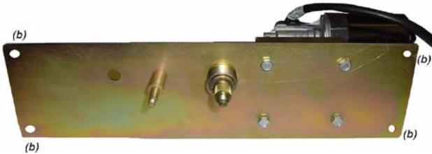
Passenger Side Mounting point (b) same as OEM equipment on both side