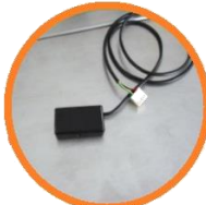
Infrared Temp Control

Shark Finishing Machinery introduces to its line of Smart print finishing equipment the SL-26 Smart Laminator. This 26.12" laminator has been designed to be compact in size and require minimum maintenance. It is easy to set up and user friendly. Equipped with stand, LCD digital display, temperature adjustment, pressure adjustment, perforating blade, infrared temperature control, the capability to laminate hot and cold as well as single or double sided.