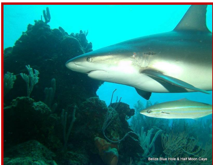
Belize Blue Hole & Half Moon Caye

Premium Wines: Cabernet, Pinot Nior, Chardonnay, Red Blend