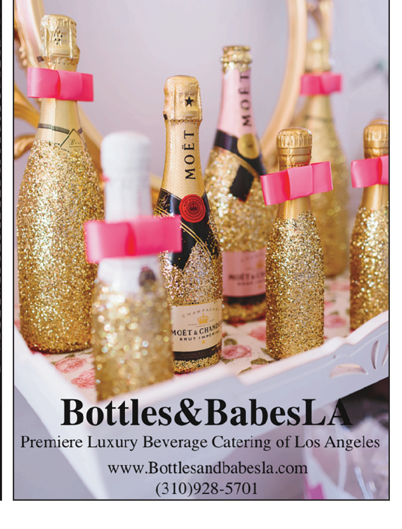
44 // bhtmag.com //