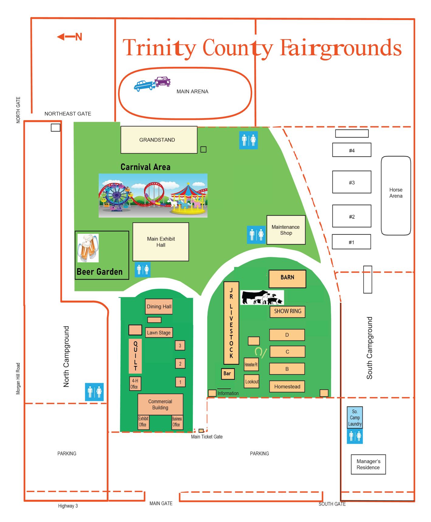
Trinity County Fairgrounds Map