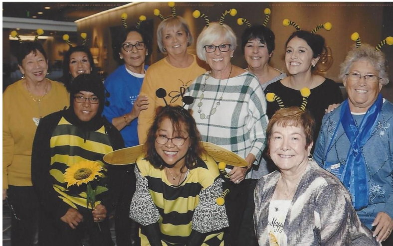
Bee-utiful Utah attendees welcomed NCCW to Utah for the NCCW Convention, August, 2023. They just may show up in April.