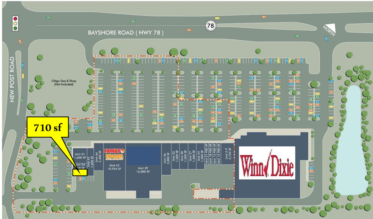
FOXMOOR SHOPPING CENTER