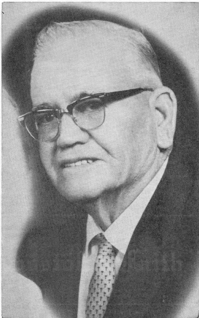
W. B. WOOSTER