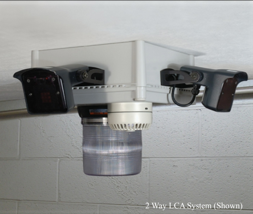
2 Way LCA System (Shown)