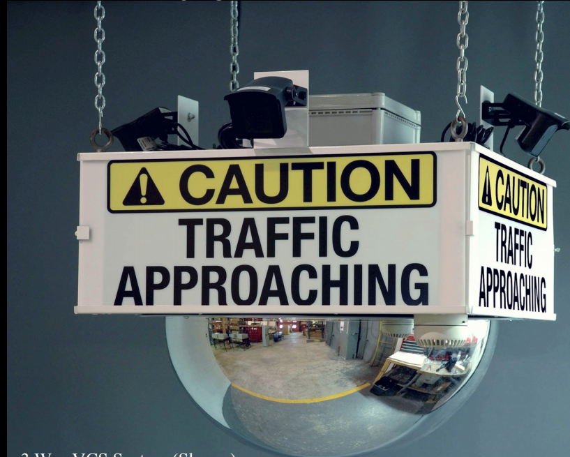
3 Way VCS System (Shown)