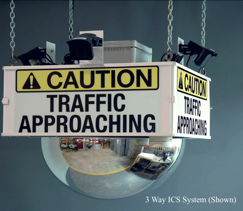
3 Way ICS System (Shown)

Make every effort to alert workers when a forklift is nearby. Enforce safe driving practices such as obeying speed limits, stopping at signs.