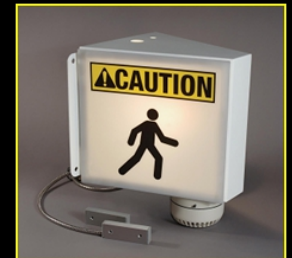
2-Sided Pedestrian Alert with Magnetic Sensor / Audible Alarm