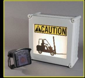
Type 12/13 Fork Truck Alert