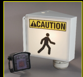
2-Sided Pedestrian Alert with Sensor / Audible Alarm