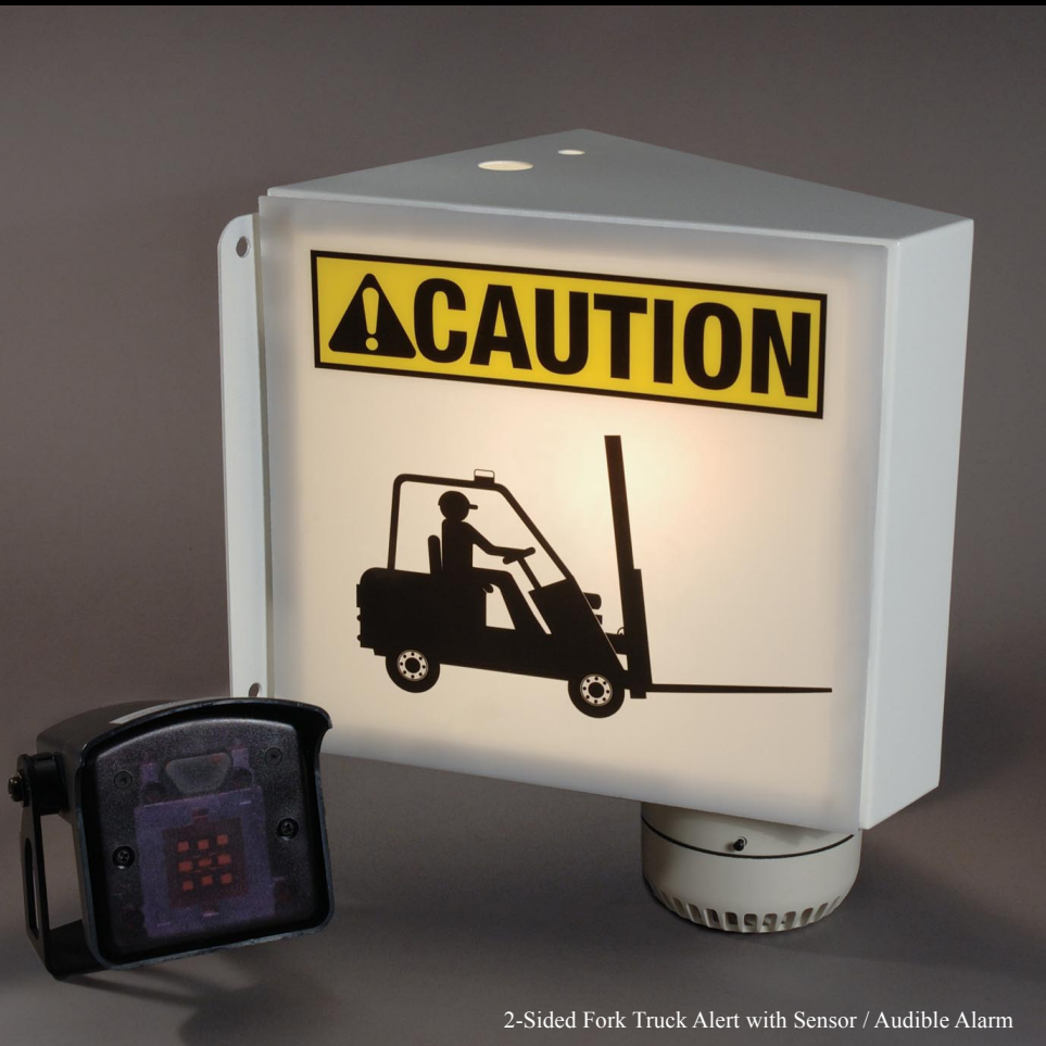
2-Sided Fork Truck Alert with Sensor / Audible Alarm