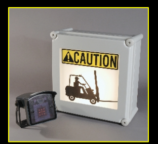
Type 12/13 Fork Truck Alert