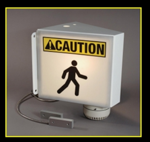
2-Sided Pedestrian Alert with Magnetic Sensor / Audible Alarm