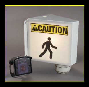
2-Sided Pedestrian Alert with Sensor / Audible Alarm