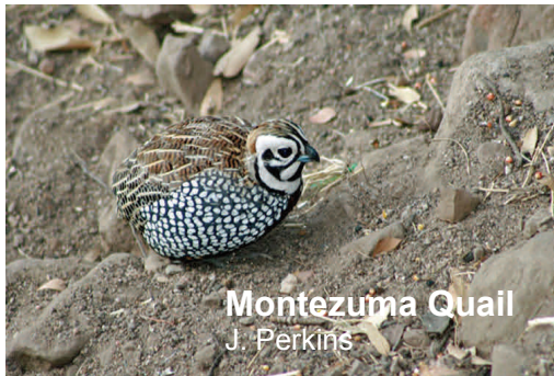
Montezuma Quail

Saturday morning we went to Ramsey Canyon, where we had Wild Turkeys , Painted Redstarts , Sulphur-bellied Flycatcher and Hepatic Tanager . We broke for lunch and then went to San Pedro House, where we saw nesting Curve-billed Thrasher , young Vermilion Flycatchers being fed by their parents, Yellow-breasted Chat , Bronzed Cowbird and Blue Grosbeaks , among others. Saturday night we had our group dinner at the Country House Family Restaurant and everyone seemed to enjoy it. We had an early start Sunday and drove to Patagonia to Paton's House, which is now a protected birding area thanks to everyone who donated money (including El Paso/Trans-Pecos Audubon Society) in order to preserve it for future genera-