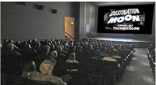
Museum of Flight - August 2019