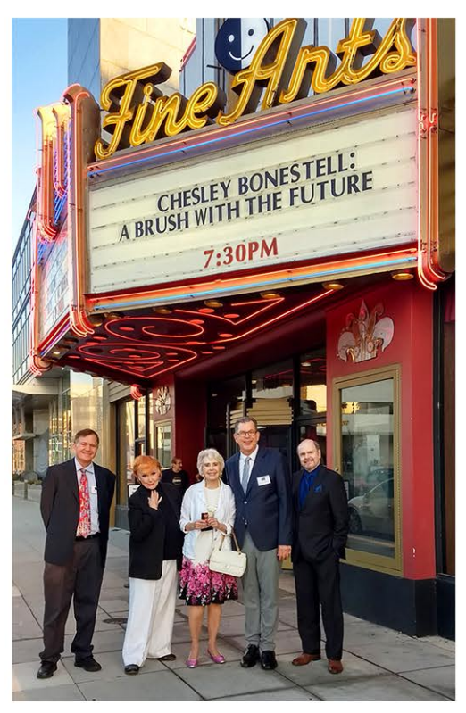
Ahrya Fine Arts Theatre - August 2019