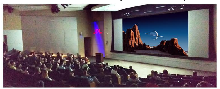
Jet Propulsion Laboratory - June 2019