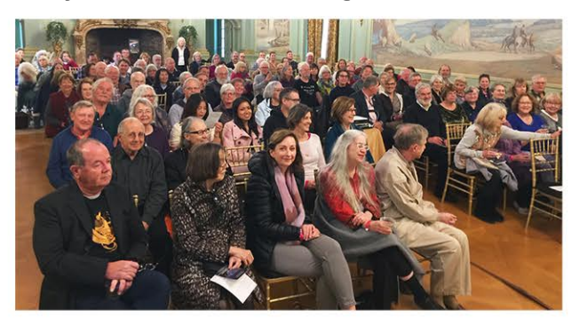
Filoli Historic Trust - March 2019