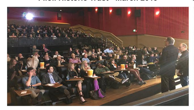
Newport Beach Film Festival - May 2018