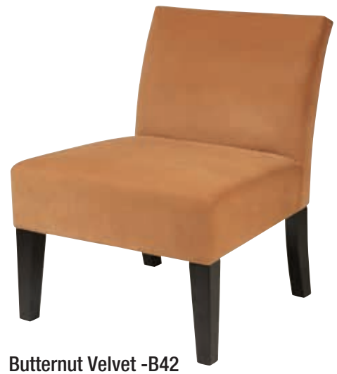
Butternut Velvet -B42