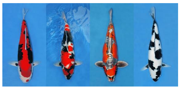
The Koi Spot What On Earth Is A Ghost Koi?