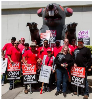
CWA Local 9510 with Bargaining Committee Members

Continue to show support for your bargaining committee!