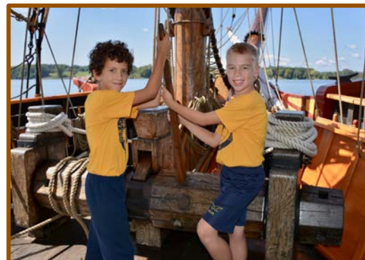
Two 4 th graders operated a windlass on the Dove

On the beautiful waterfront, they toured the Maryland Dove , a replica small trading ship, and participated in hands-on activities to learn about winches, anchors, and navigation techniques.