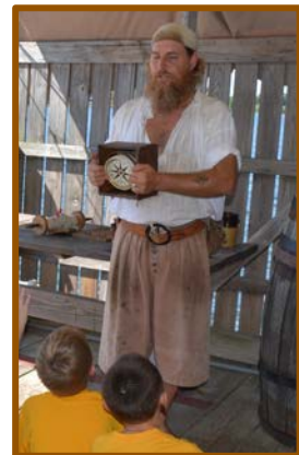
The Bosun of the Dove explained how colonial-era compasses worked