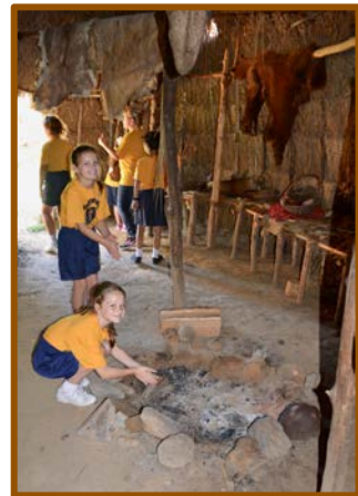
Students explored a witchott