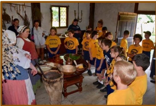
Students learned how food was prepared and stored in a colonial kitchen