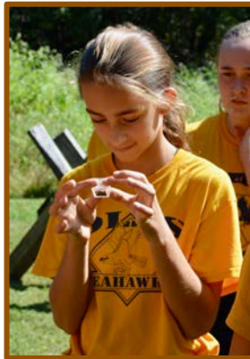
A 7 th grader examines tiny tobacco seeds

Next they toured the Godiah Spray Tobacco Plantation, a working colonial farm, and helped grind and sift corn in the kitchen. They learned about the tobacco trade during colonial times, rolled barrels used to transport tobacco, and observed drying tobacco leaves. In the historic town center, they got to view a working printing press, storehouse, and housing.