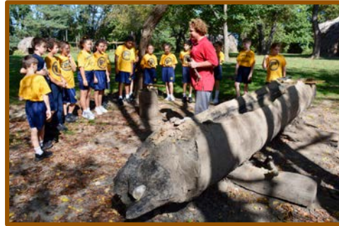
A historian explained how canoes were made from burning tree trunks

They visited the reconstructed Brick Chapel of 1667, and toured a recreated Woodland Yaocomo Indian Hamlet. They learned how they made canoes from tree trunks, what the inside of a witchott looked like, what tools the Yaocomo used, and how they traded with the colonists for goods they brought from England.