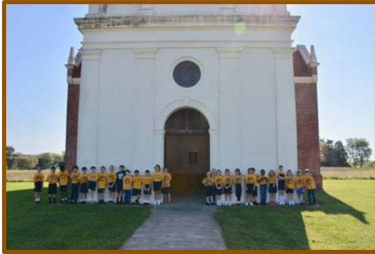
3 rd , 4 th , & 5 th grades outside the Brick Chapel of 1667