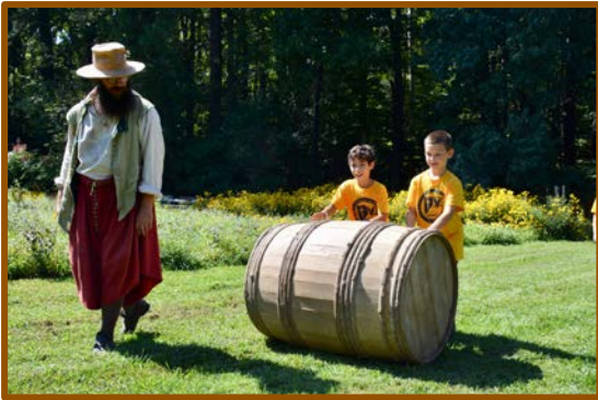
4 th graders roll a hogshead tobacco barrel