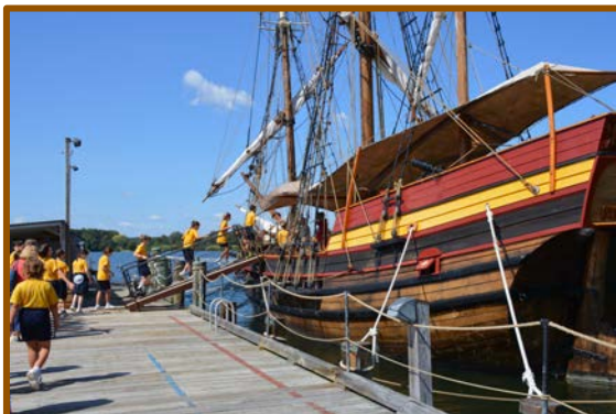
Middle schoolers board the Maryland Dove

Last week, several grades visited Historic St. Mary's City for a field trip. Our student learned so much about life in 17th-century Maryland.