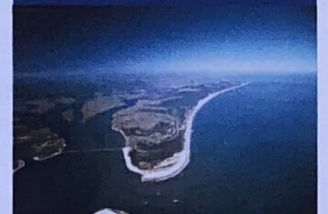
Aerial view of Amelia Island