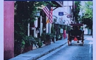
Historic St. George St