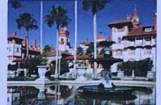
St. Augustine, our Nation's Oldest City

Day 9: After enjoying a Continental Breakfast, you will depart for home... a perfect time to chat with your friends about all the fun things you've done, the great sights you've seen and where your next group trip will take you!