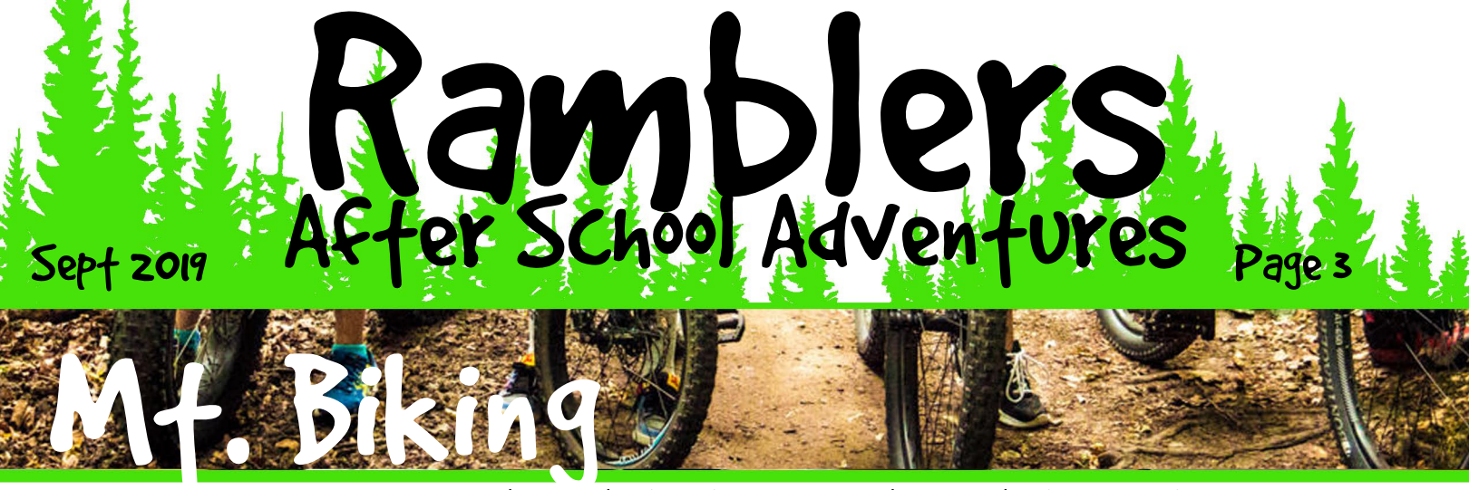
RES, WCS, and HCS Fridays 9/6 and 9/13 (intro) and Fridays 9/20 and 9/27 ("Extreme") 3:00 - 6:00

Krysy Stecklar and Marcus (aka Mario) Wadlington will be ripping through the mountains with your kids on extreme (and not so extreme) adventures. The first two sessions of the month will be designed around getting kids new to mountain biking comfortable riding in the woods, over rocks and roots, and over some easier bridges. All kids will need to be comfortable on a bike to participate in this session.