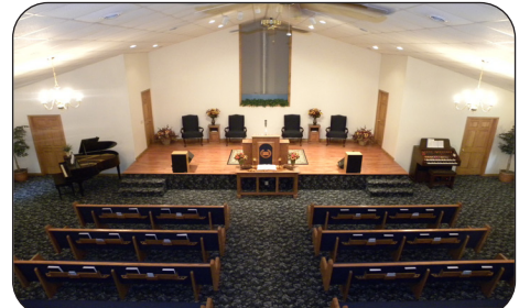
A ministry commissioned by Mt. Salem Baptist Church.

P.O. Box 186 ~ West Union, WV 26456 ~ 304.873.2315