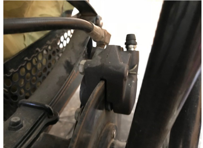
Brake system with the rubber nipple cover in place.

Finally felt that we had filled the lines and weren't seeing masses of air bubbles so we closed up the system, removed the vacuum tool and popped the nipple covers back on the bleed fittings.