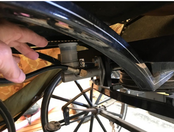
The brake fluid reservoir, just out of reach!

We reversed positions and David got to do the valve/push/pump part of the job while I kept the reservoir filled as fluid finally drained into the catch-bottle. In the process I knocked over the bottle of brake fluid. I overfilled the reservoir and more fluid spilled. Fortunately we had put a metal shop tray under the reservoir so at least that part of the brake fluid didn't hit the rubber mat flooring in the barn. (Did I mention that we both were wearing rubber gloves and eye protection?)