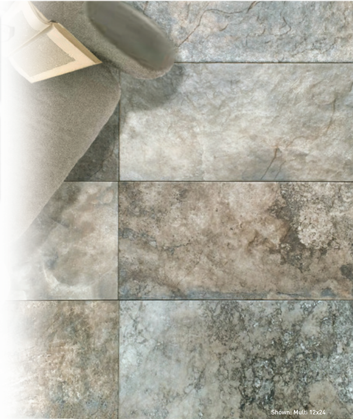
Shown: Multi 12x24