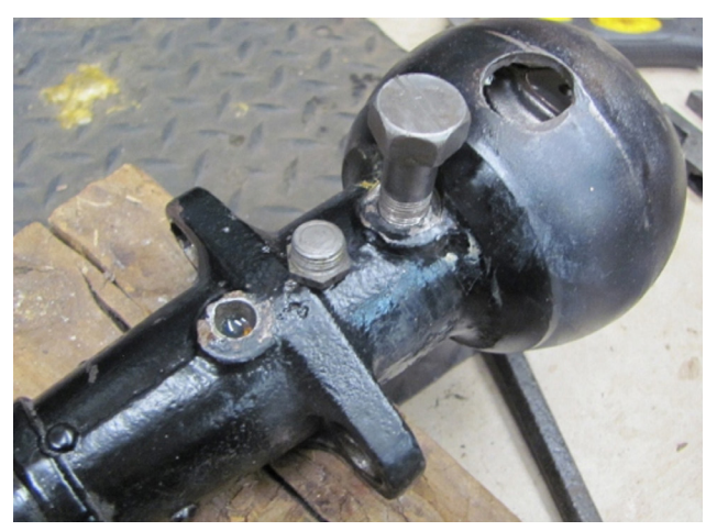
Bolt threaded into torque tube

Next, block or "backer bar" the opposite end of the pin, placing a rear axle brake shoe support retaining bolt (p/n T-2567) over the rivet pin. The threads of this bolt are the same as the torque tube plug ( \frac{1}{2} " x 20 TPI, p/n T-2578). Thread in this bolt fully so that the end is flush with the new pin.