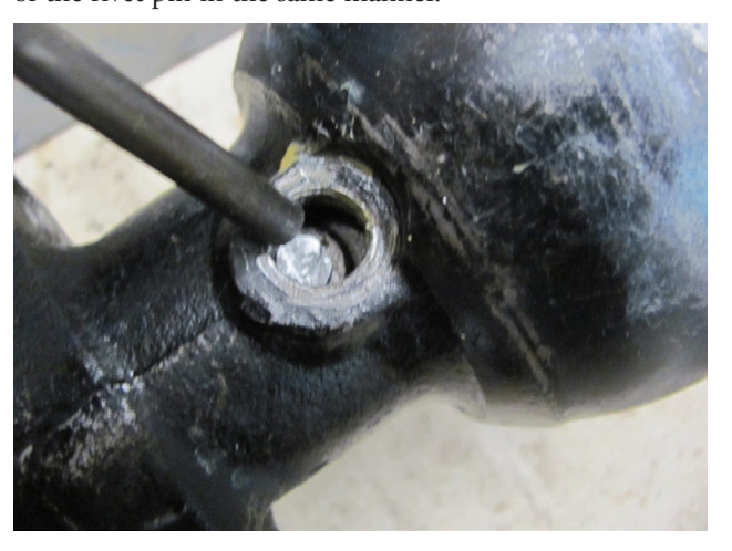
Regards, Dan Treace

Finally, with a small drift punch on the other side, flatten the end to peen the rivet pin as shown in the photo below. Turn the torque tube assembly over and peen the other end of the rivet pin in the same manner.