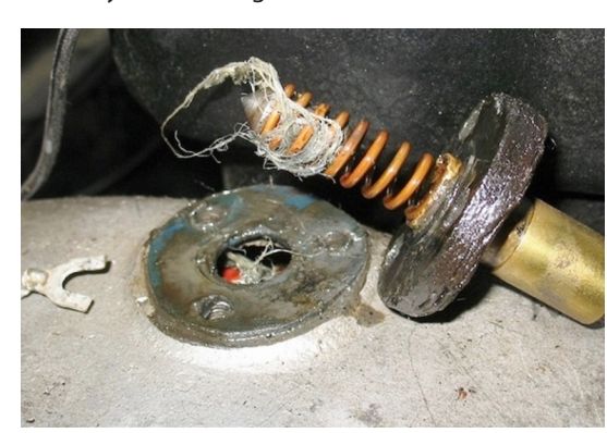
Debris accumulated on magneto contact.