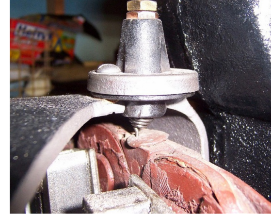
Cutaway view of magneto and contact