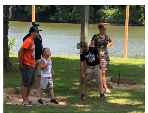
Horseshoes being enjoyed by one of NTAG's family.