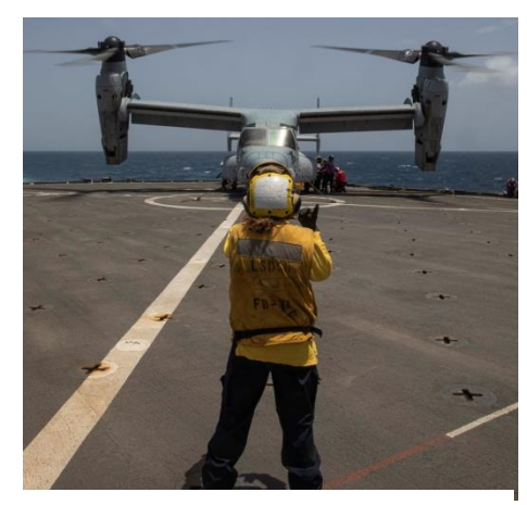
Training with Osprey Ops.