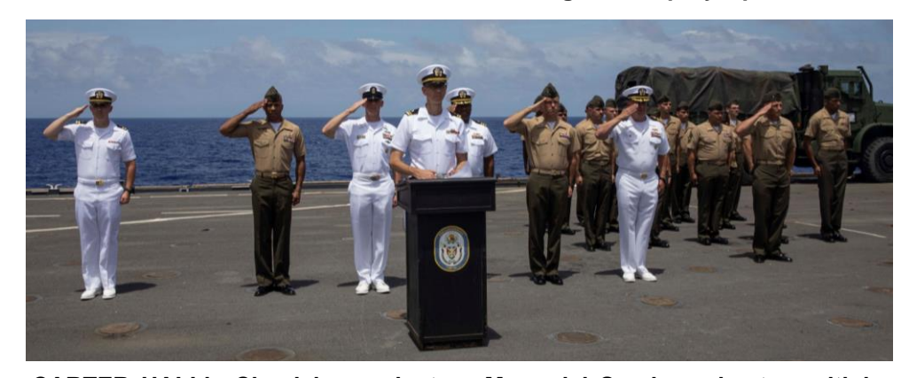
CARTER HALL's Chaplain conducts a Memorial Service prior to multiple burials at sea.