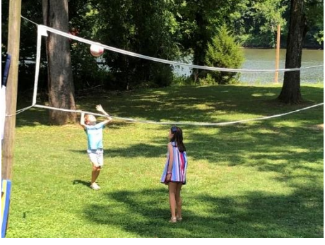
Will someone come play with us?