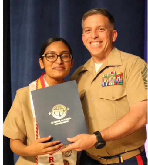
Navy League's Top Cadet Award