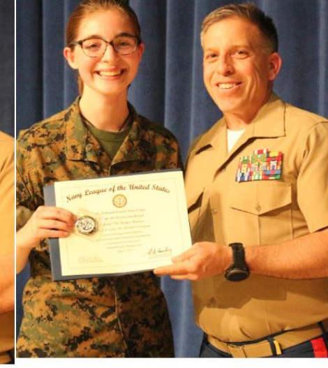
Navy League "Perseverance" Award