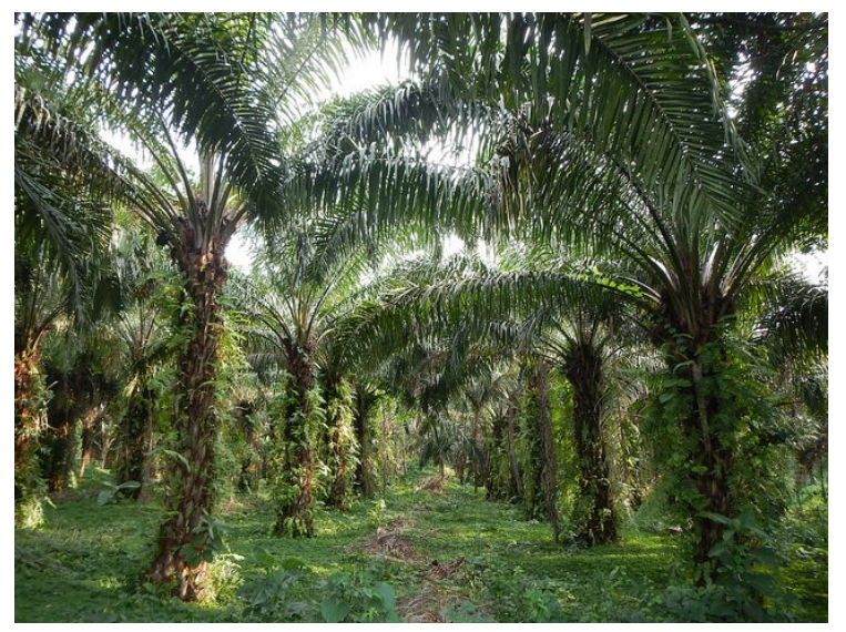
Oil palm trees